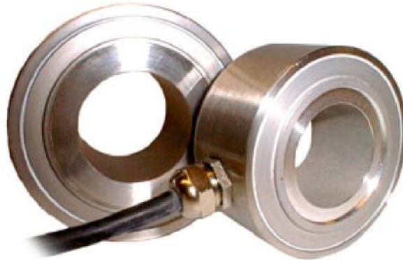
MODEL DT 1900

FORCE WASHER MODEL DT 1900 STANDARD CAPACITIES: From 1 Tons to 20 Tons