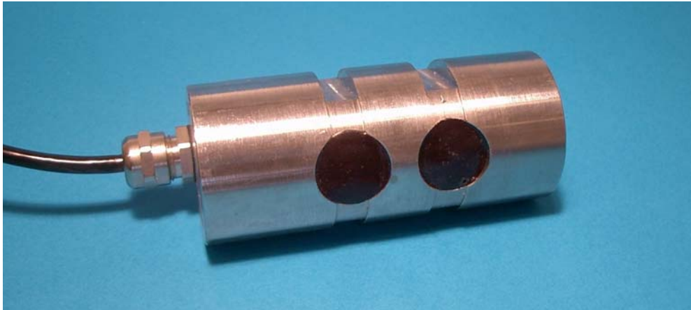
MODEL DT 1701