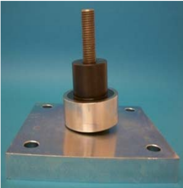
MODEL DT 1M20