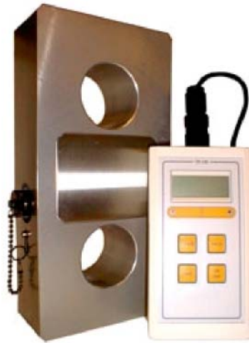
MODEL DT 8290